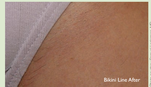
Bikini Line After