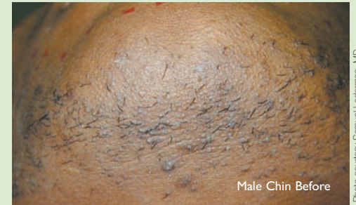
Male Chin Before

Using the latest technology in laser hair removal, the CoolGlide can rapidly treat large areas without the limitations of older technologies. The CoolGlide longer wavelength allows it to be used safely and effectively on patients with light or dark skin as well as tanned skin. Unlike other systems, the CoolGlide can treat the fine hair on a woman's upper lip just as easily and effectively as the coarse hair on a man's back. The cooled handpiece increases patient comfort and minimizes the adverse skin reaction commonly seen with other lasers.