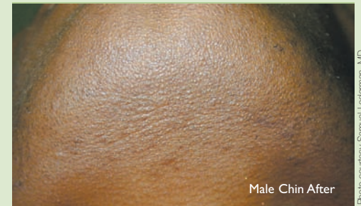
Male Chin After